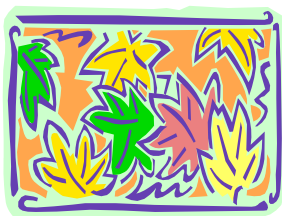
Autumn Leaves are Falling!

We also ask parents to help staff teach children to wash their hands after each time they use a tissue (or their hands!) to wipe their noses or cover coughs and sneezes.