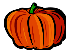
"First you take a pumpkin—big and round and fat..." Ask your child to finish this fingerplay!

pictures or video/digital recordings at any time.